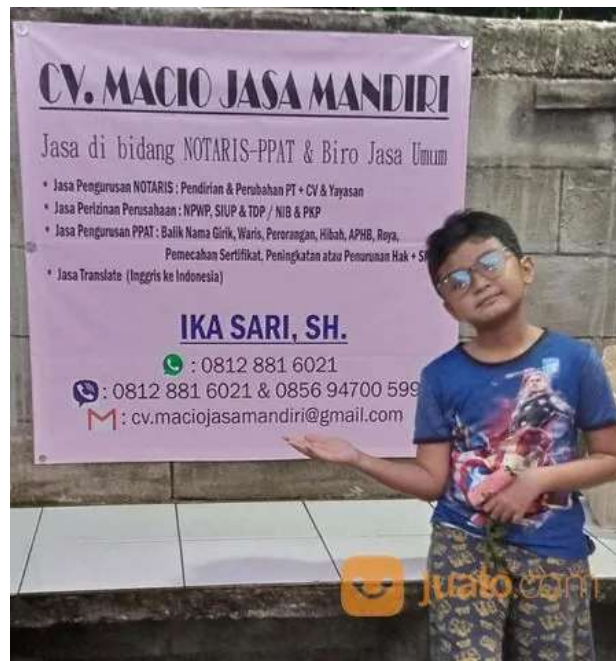
Gambar 1. Contoh Iklan Notaris Nondigital