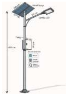
Figure 3. Tool Design