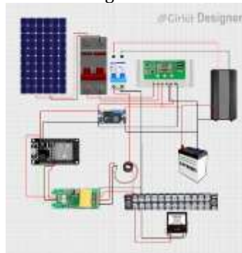
Figure 2. Equipment Circuit Schematic

The wiring configuration that I have designed to interconnect all components is as follows: