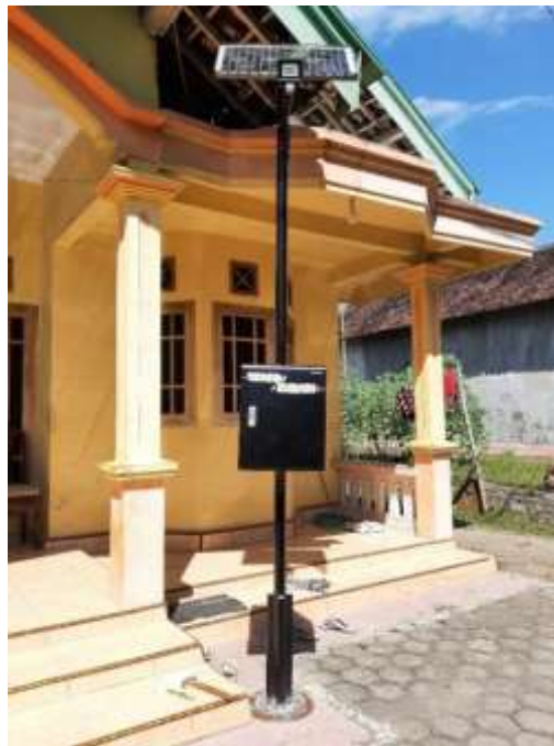
Figure 4. Photovoltaic (PV)

This research was tested in the researcher’s residential environment by designing and implementing an Internet of Things (IoT)-based electrical energy monitoring system utilizing the NodeMCU ESP32 as the microcontroller, the PZEM-004T sensor module for measuring electrical parameters, and the Node-RED platform as the medium for data visualization [11], [12]. The system developed is capable of performing real-time data acquisition from the solar panel, including measurements of voltage, current, power, and generated electrical energy, as has been widely implemented in household energy monitoring systems and solar generator applications using the ESP32 and PZEM-004T modules [10], [4]. Furthermore, the measurement data are automatically transmitted via Wi-Fi to a local server or cloud platform and visualized through a Node-RED dashboard, allowing users to monitor energy consumption and production in real time and analyze historical data for system performance evaluation [13], [6].