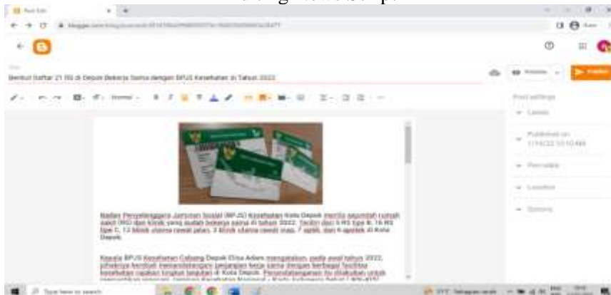
Editing News Script

After make edits to make sure the words are done appropriate and appropriate , Info Depok journalists also carried out the editing process for putting Photo as illustration or even activity actually what you get directly by an Info Depok journalist .