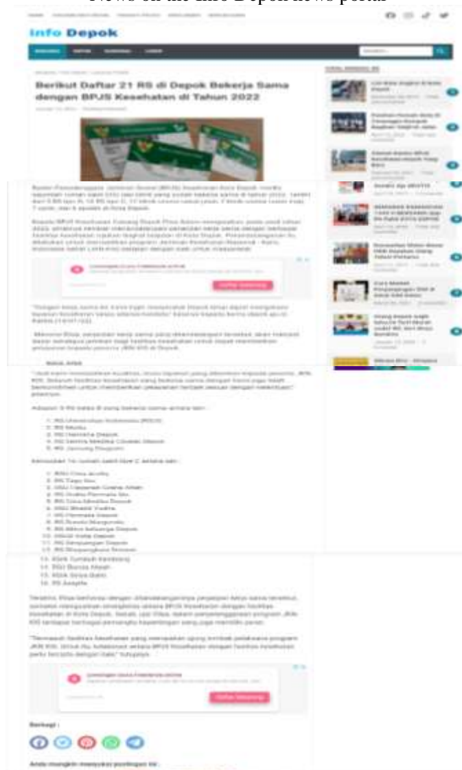
News on the Info Depok news portal