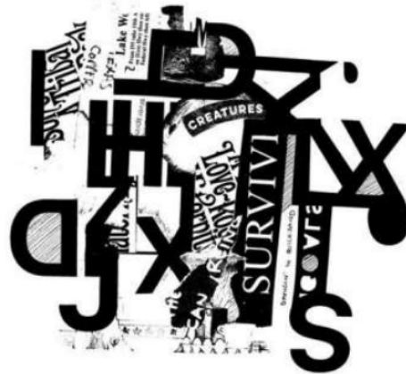
Figure 4. Figure Composition 16 (last), Identification of Emotions – "Anger"

Moreover, after experiencing a personal loss in the family, I find myself contemplating the value of identifying ten secondary emotions and expressing a desire to delve deeper into their significance in accurately capturing the grieving process. In the first set of five, the writer proceeds to enumerate descriptive terms that encapsulate their own emotions, considering the possibility that expanding the vocabulary could prove fruitful. As for the subsequent set of five, the author employs identification tables. The list ultimately concludes with "Sad," which would have been the primary emotion selected even in the absence of the ten secondary emotions. This outcome instills the author with a sense of confidence that this approach holds promise for their ongoing composition work, prompting further exploration. At this juncture, the author ceases taking notes, feeling that they have solidified their understanding of emotion identification and the creative process, and focuses primarily on generating compositions using this method in their 15th and 16th pieces.