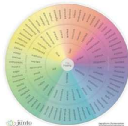
Figure 1. Wheel of Emotions & Feelings (Source: The Junto Institute, 2021)